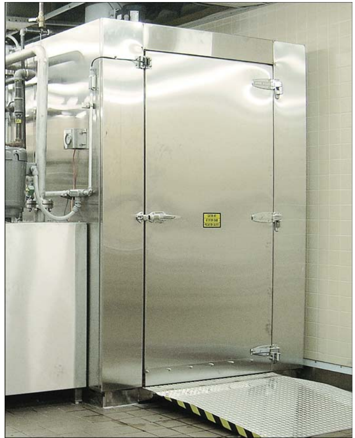
Model KS-88 Floor mount installation with optional side-mount tank